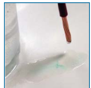
Approx. 40 hours later