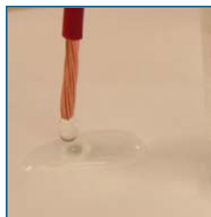
Approx. 24 hours later